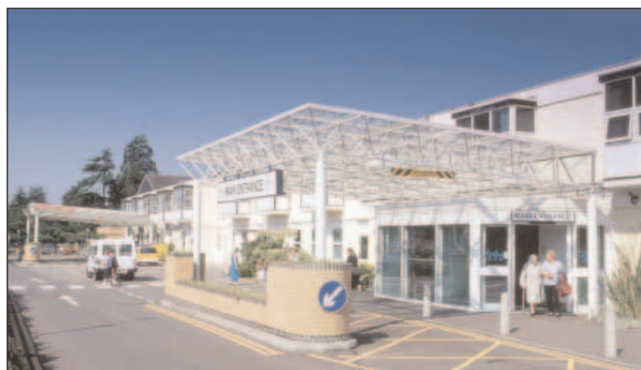
Frimley Park Hospital

Here is where the money you have given us has been spent. Every pound you donate goes straight to where it is needed most. Our admin costs are virtually zero because everyone who works for our charity gives their time and effort absolutely free.