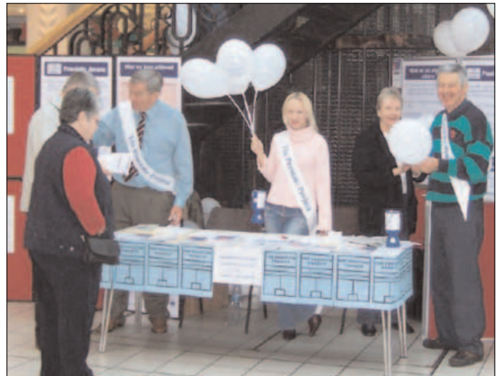
Members of our Frimley Support and Awareness Group collecting in Camberley

A series of meetings with invited speakers are planned for 2005 at Frimley Park Hospital and the Royal Surrey County Hospital. Dates will be published in the next issue of this Newsletter.