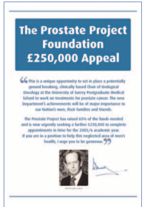
The front cover of our appeal brochure

And finally, we have the new and adjacent Post Graduate Medical School whose work is primarily focused on research. The integration of medical disciplines and the close relationship between the University and RSCH make the Postgraduate Medical School the ideal place to undertake a project of this