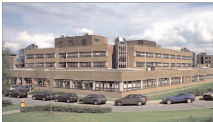
Royal Surrey County Hospital